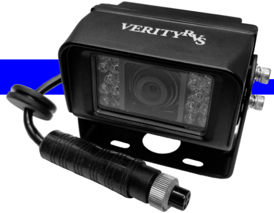
Image type: 1/3-inch Sharp® color CCD (no cheap off brands used) With audio Viewing angle: 130° Waterproof: IP69K System: NTSC Aluminum housing waterproof camera with Allen screws for insured positioning Horizontal resolution: 400 TV lines Effective pixels: 510 x 492 Minimum illumination: 0 Lux (built-in 18 high output IR LEDs for night vision) Shockproof: 10G Operating temperature: -40°~70°C Power supply: DC 12V (powered by monitor)